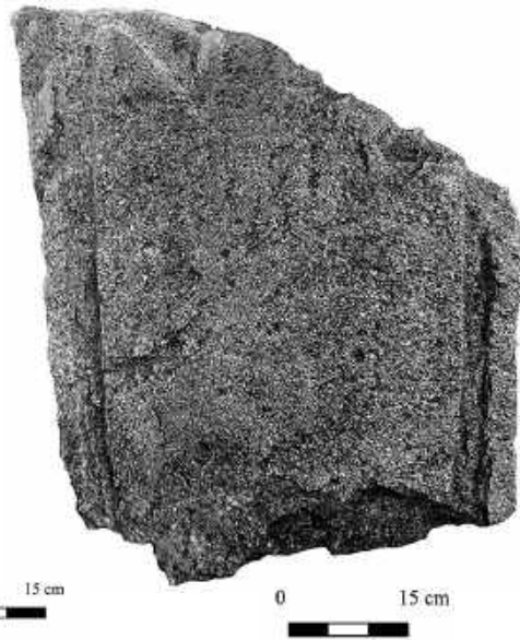
Fig. 3. The tombstone. 3 rd -2 nd centuries BC

One of the tombstones (Fig. 2) was found on the surface north-west of the site. It is a broken rectangular stele made of local limestone, measuring 80.5×55×15 cm. Only the upper right part of the tombstone with a low relief is preserved. It represents the head, neck, sharp shoulder and part of the body of an anthropomorphic figure. The known parallels, as well as specific details, such as part of the neck of suggest that another anthropomorphic image was located to the left. This stele must have belonged to group 2 of the 16 th type of the anthropomorphic gravestones according to the classification by of N. V. Moleva 9 and is dated to the 3 rd century BC.