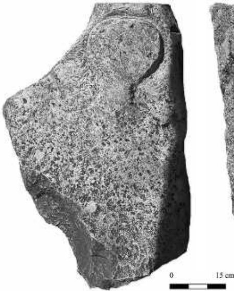
Fig. 2. The tombstone. 3 rd century BC